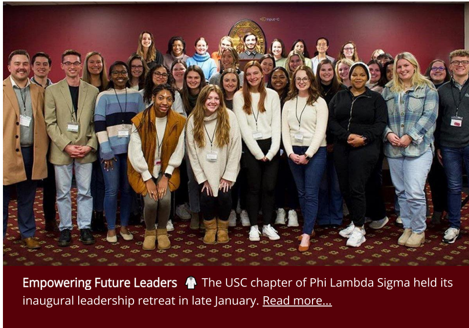
Empowering Future Leaders 📍 The USC chapter of Phi Lambda Sigma held its inaugural leadership retreat in late January. Read more...