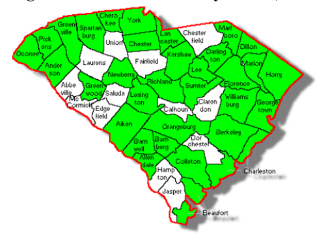
Figure 3 – Counties Served by Clinic (2018-21)