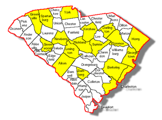
Figure 6 – Counties Served by Clinic (2020-21)