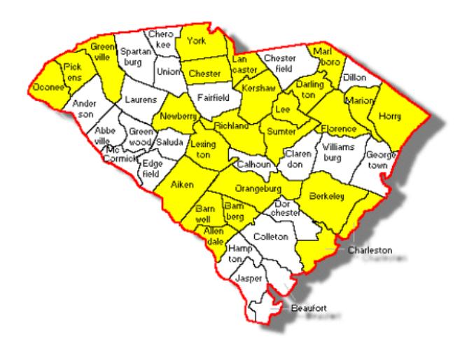
Figure 5 – Counties Served by Clinic (2019-20)