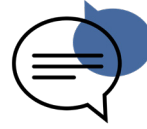
Professional & Civic Engagement