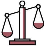
Diversity & Social Advocacy